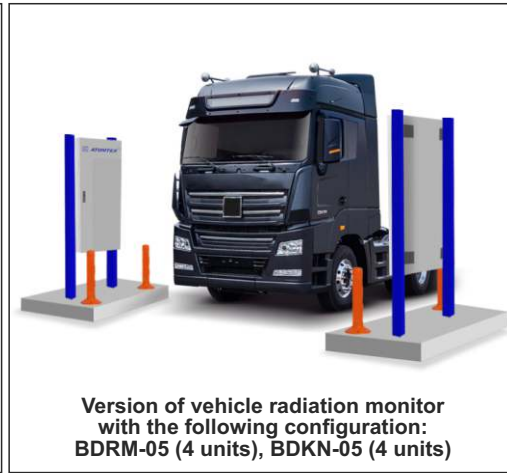
Version of vehicle radiation monitor with the following configuration: BDRM-05 (4 units), BDKN-05 (4 units)