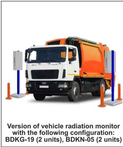
Version of vehicle radiation monitor with the following configuration: BDKG-19 (2 units), BDKN-05 (2 units)