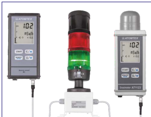
Dosimeter with remote control and external alarm unit

Remote control and external alarm unit can be attached to dosimeters for remote monitoring applications.